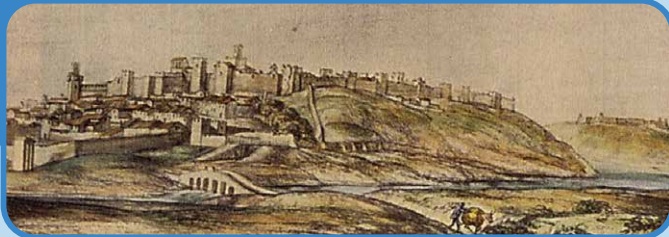
Detail of the 'Alcazaba' (citadel) on the view of Badajoz by Pier Maria Baldi, 1669.

The buildings and constructions it holds in its inside show the different functions the enclosure had at the different periods: Islamic citadel, medieval castle, fortress of modern fortification, currently leisure area and cultural and educative equipment.