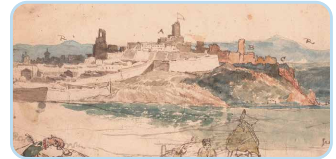
Aquarelle made during the British siege of 1811, with the citadel's wall and buildings partially reduced to ruins.