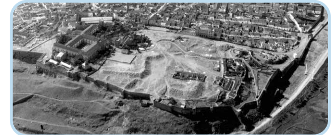
The photograph shows the old Military Hospital; the only army building used in 1935.