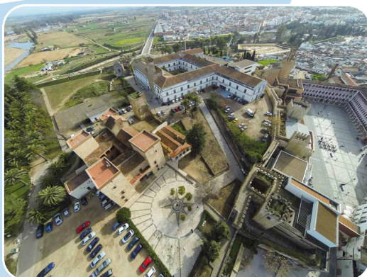
The citadel and the city. The wall surrounding the Islamic citadel separated it from the rest of the city.