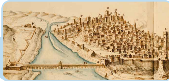
Citadel detail on the view drawn by Lorenzo Possi, 1668.