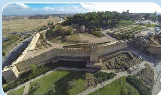
The wall. The wall was constructed using the rammed earth technique, and it has been continuously repaired and modified throughout History.

Today the Citadel is largely landscaped, with scattered ruins of old buildings such as the hermitages of La Consolación and El Rosario, the old church of Calatrava and the remains of some mediaeval fortified houses. They all stand alongside those which have appeared in recent archaeological excavations.