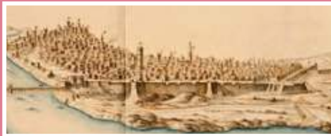
The View of Lorenzo Possi of 1668 shows the medieval wall reinforced with ravelins and stockades.

Currently, the wall is mostly preserved built in a large urban park that occupies its moats whereas the bastions hold different social and cultural equipment.