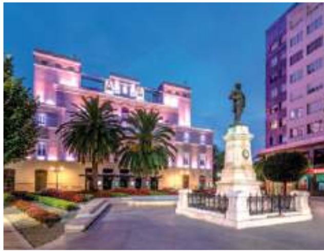
Plaza de Minayo

Before starting the tour covering the Squares and Unique Buildings we advise you to visit either of the Tourist Information Offices for further information.