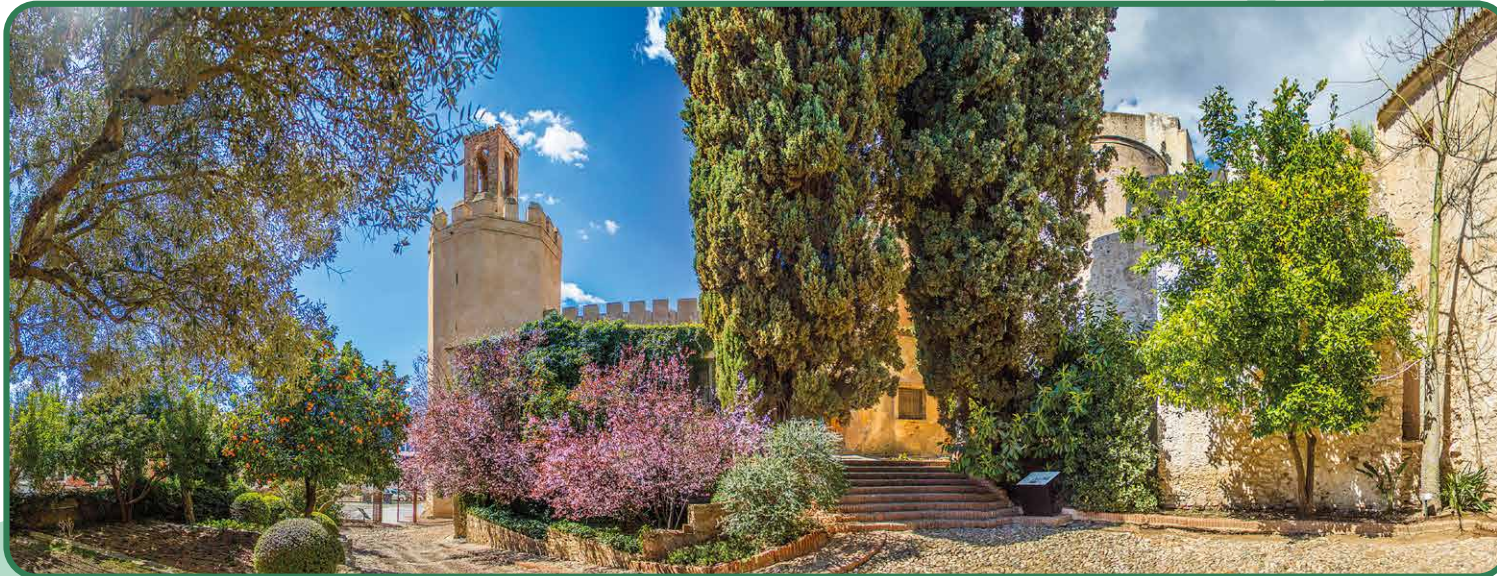
La Galera Gardens.